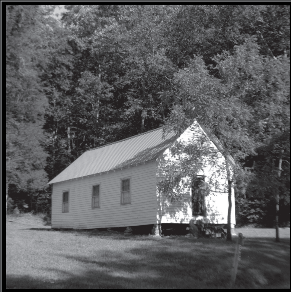
Rose Creek Schoolhouse, built circa 1900, Macon County, North Carolina.