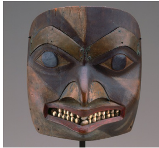
Maskett 1840, Smithsonian National Museum of the American Indian

The Westward Movement highlights, in slides and prints, the creations of popular artists Frederic Remington and Charles M. Russell. As painters and sculptors, they captured the wild beauty of the West in their depictions of the Western expansion of North America.