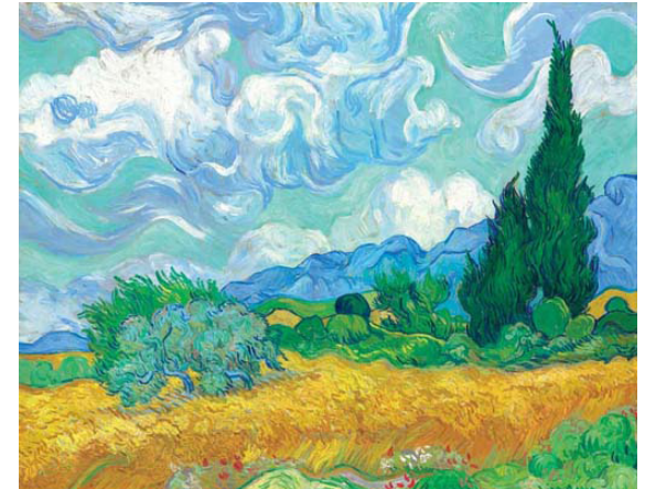
Vincent Van Gogh, 1889

Other programs are available upon request. For example: